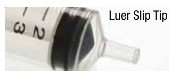
Luer Slip Tip