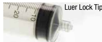
Luer Lock Tip