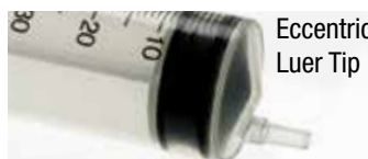
Eccentric Luer Tip