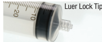
Luer Lock Tip