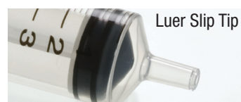
Luer Slip Tip