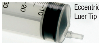
Eccentric Luer Tip